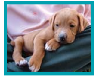
One of our foster puppies