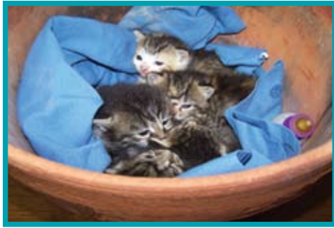
This litter of kittens came to the facility in a flowerpot.

All they need is love. We are experiencing a tremendous increase in cats and kittens here at Suncoast Humane Society. This is why our Foster Home Program is so important. Being a Foster Parent is hard work. Many of these animals are newborns, having been separated from their mothers much too soon, and may need to be hand-fed. Other animals we place in foster care are ill or injured and need to have medication administered regularly. Our foster parents house and care for these precious animals