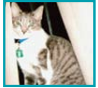
Rascal Wilson Alumni